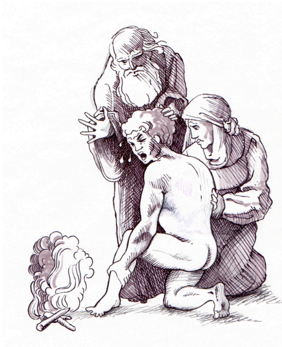
A Communal Coping Model of Catastrophizing

Although it may seem counterintuitive to adopt the theory that catastrophizing is a method of coping, there have been recent suggestions that catastrophizing may indeed be employed in an effort to garner social support from others (Sullivan et al., 2000). Sullivan and his colleagues have proposed that catastrophizing might represent a 'communal' approach to dealing with the distress of pain. This model emerged from research showing that individuals who catastrophized not only experienced more pain, but were also more expressive during their pain experience (Sullivan et al., 2000).